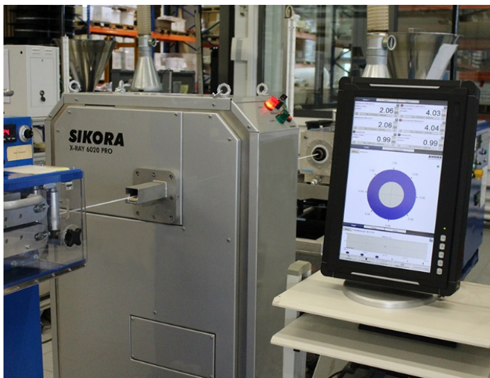
Picture 1: SIKORA's X-ray measuring system X-RAY 6000 measures all hose parameters. At the monitor of the processor system ECOCONTROL 6000, the product data are being visualized.

Erich Kipping is especially pleased with the cooperation with SIKORA; not only regarding the measuring technology and the accompanying benefits, but also with the customer support. "In SIKORA, we have found a reliable and competent partner who is available at any time and offers perfectly customized solutions. Therefore, we will continue to use measuring devices from SIKORA in our lines in the future."